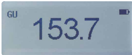
Normal Mode Interface