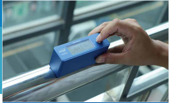
LS193-For Curved Surface / Small Size Material