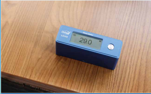
LS192-For Flat and Regular Material