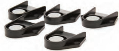
HI920005 Tag holders with tags (5)

Install tags near your sampling points for quick and easy iButton® readings. Each tag contains a computer chip with a unique identification code encased in stainless steel. You can install a practically unlimited amount of tags.